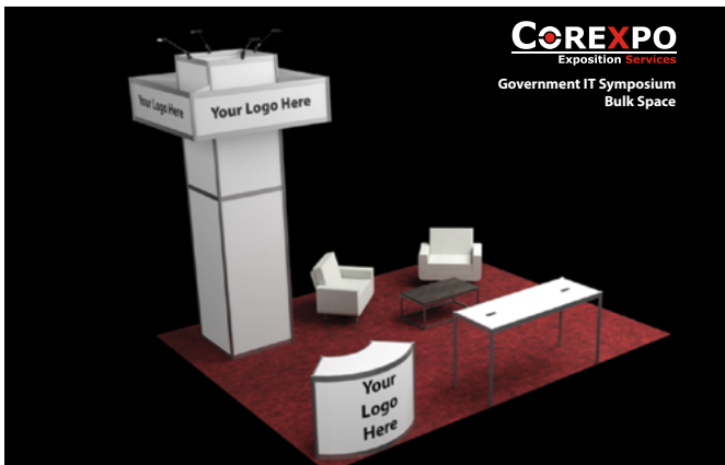
EXHIBIT ONLY OPTIONS