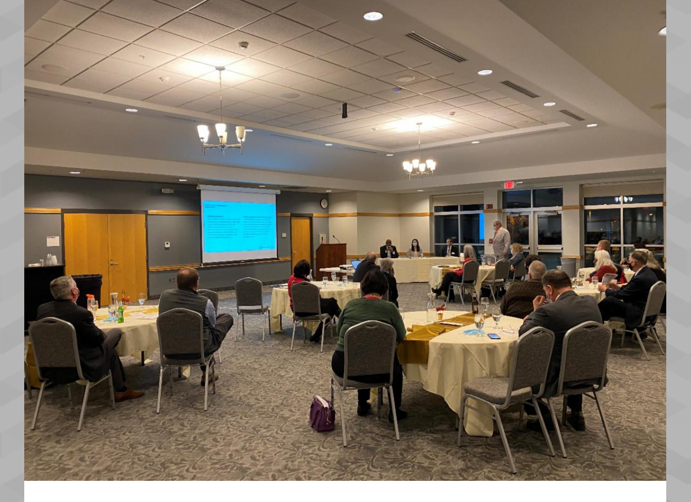
Thank you to those who attended!